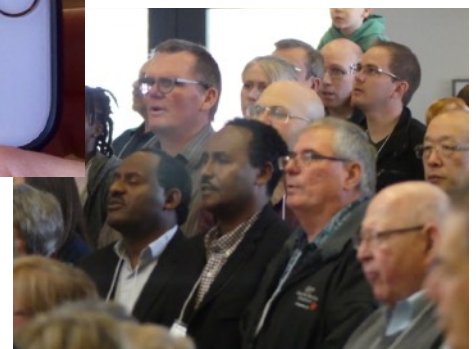
Some of the attendees worshipping at the Missions Conference.