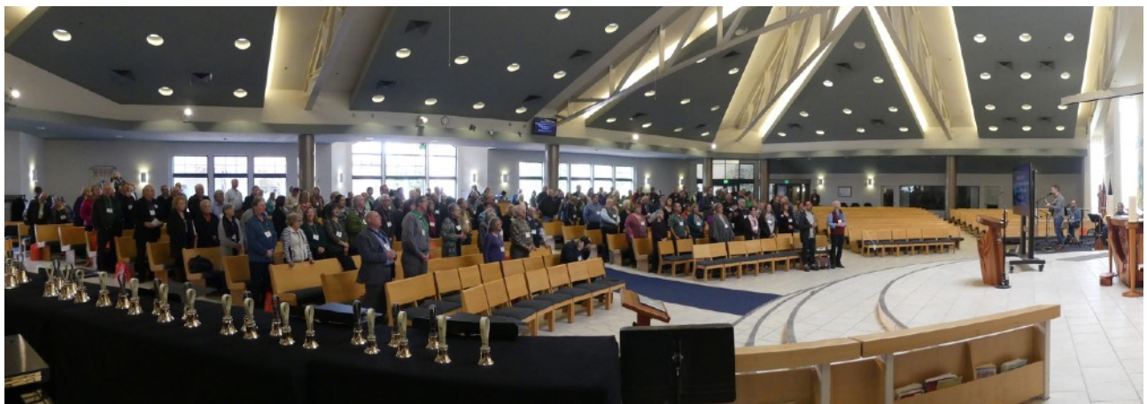
Our Savior, Livermore served as the host church.

We are pleased to be able to present this year’s conference in review so that it might provide ongoing inspiration and training to people around our District and throughout our Synod. Virtually all aspects of this conference are or soon will be available as downloadable video through Vimeo and can be accessed through this link: http://www.cnh-lcms.org/2018missionsconferece . See the next page for a list of the videos that will be available.