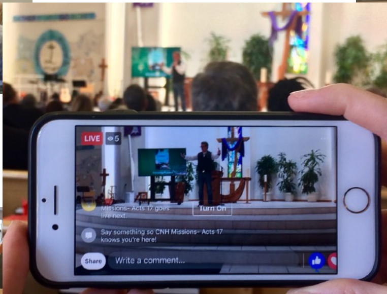
The Missions Conference was available on a Facebook Live stream picked up by four congregations in the District.